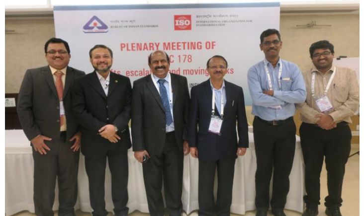
BIS ETD 25 Delegates Participation in ISO Event – Oct 2017