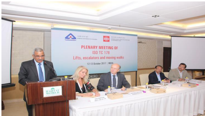
ISO Event Opening Function – Oct 2017