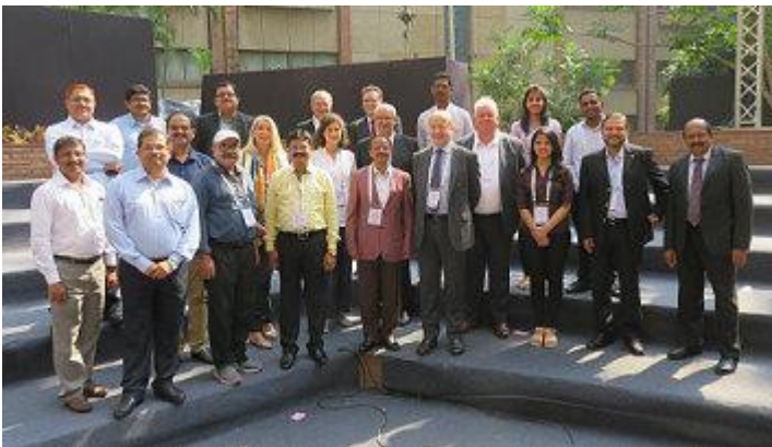
Indian Delegates Participation in ISO Event – Oct 2017